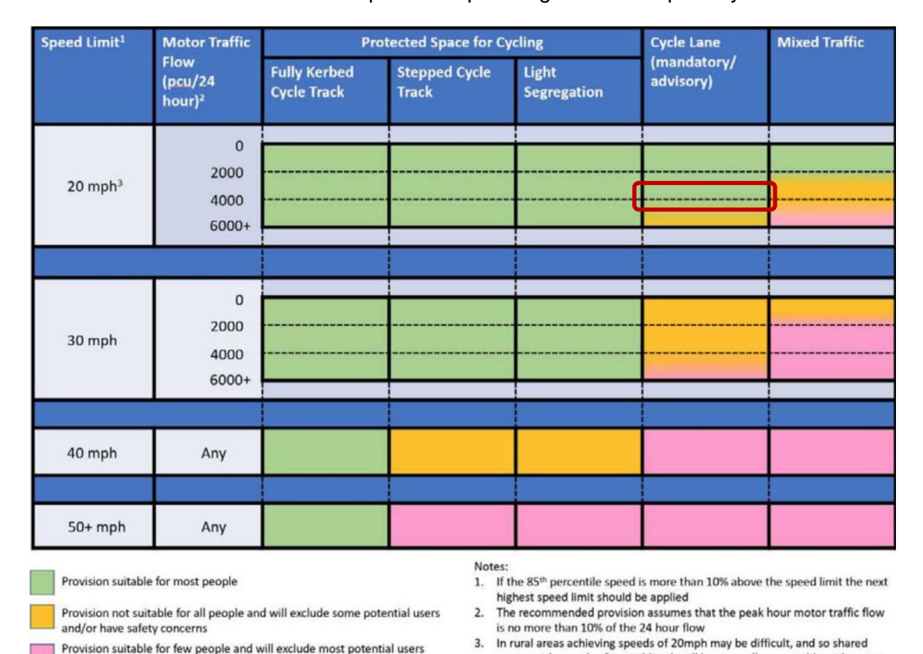
Figure 2: suitability of provision for cycling, as laid out in LTN 1/20, Figure 4.1, "Appropriate protection from motor traffic on highways".

Government guidance has been provided by the Department for Transport in LTN 1/20 – "Cycle Infrastructure Design". Appropriate levels of protection for cycles from motor traffic are indicated in Figure 2, below. For speed limits of 20mph, advisory cycle lanes are considered suitable for most cyclists with motor traffic flow rates of up to 4000 passenger car units per day.